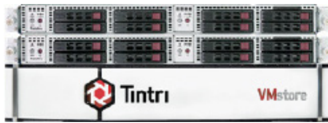
The Smartest Storage for the Best VDI Experience